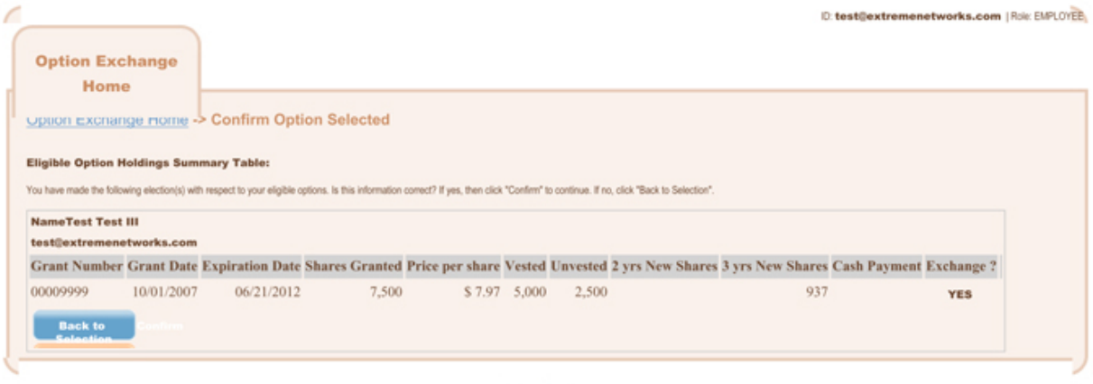
contact us | log out